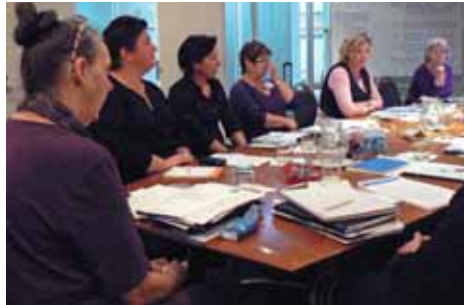
CHPA, WESTNET, NYCH and NESB reference group meeting